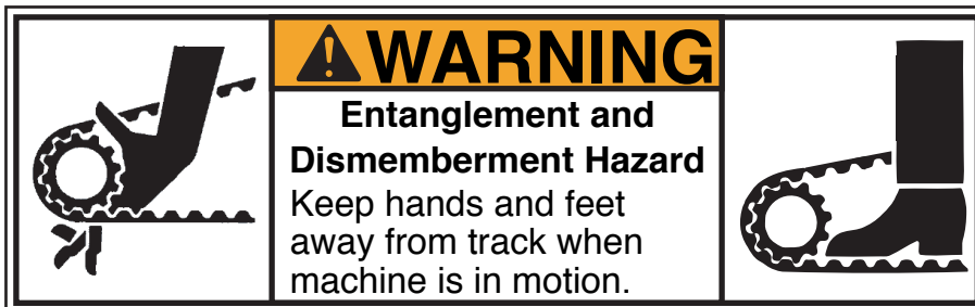
Figure 3.2 From Lehto/Miller Warnings I The Linear Sequence Determining Warnings Adequacy

Excavator Label: This label (below) was designed for use on an excavator. The icons were selected from or based on hazard description pictorials found in Annex A of ISO 9244:1995(E): Earth Moving Machinery - Safety Signs & Hazard Pictorials - General Principles.